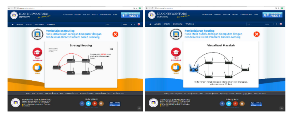
Fig. 3. Contents of routing strategy and problem visualisation