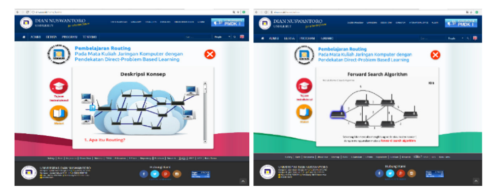
Fig. 2. Contents of concept description and routing algorithm menu

Fig.3 depicts a few contents of routing such as routing strategy and problem visualisation. The strategy routing explained one of the routing strategies, namely flooding strategy. Meanwhile, the problem visualisation explained one of the problems in the routing process; for example, when one of the routers has an overload process.