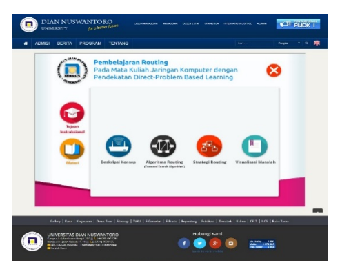
Fig. 1. Main menu of the multimedia teaching and learning for Computer Networks Subject

Fig.1 depicts a few contents for the Multimedia teaching and learning of Computer Networks which included instructional goals, concept description, routing algorithm, routing strategy, and problem visualisation.