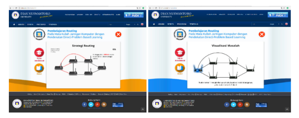
Fig. 3. Contents of routing strategy and problem visualisation