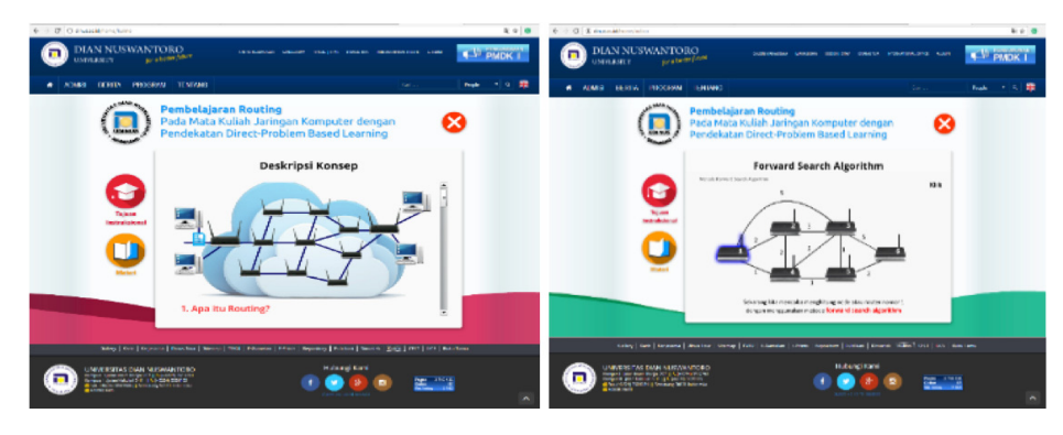
Fig. 2. Contents of concept description and routing algorithm menu

Fig.3 depicts a few contents of routing such as routing strategy and problem visualisation. The strategy routing explained one of the routing strategies, namely flooding strategy. Meanwhile, the problem visualisation explained one of the problems in the routing process; for example, when one of the routers has an overload process.