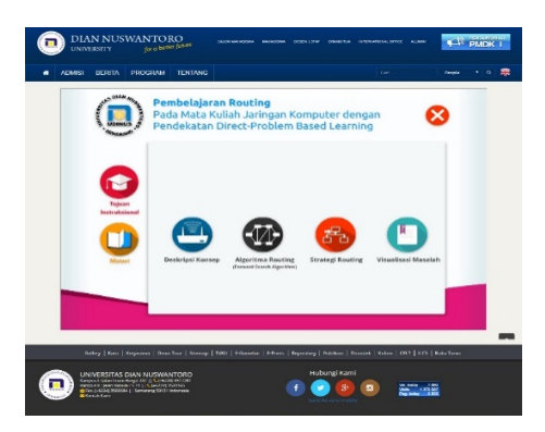
Fig. 1. Main menu of the multimedia teaching and learning for Computer Networks Subject

Fig.1 depicts a few contents for the Multimedia teaching and learning of Computer Networks which included instructional goals, concept description, routing algorithm, routing strategy, and problem visualisation.