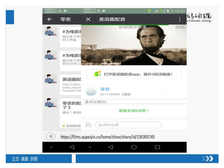
Fig. 2. Dubbing the short video

The following figures give the examples of the experiment class teaching based on the net. Figure 2 is the assignments checking. Figure 3 is the new points in learning the lessons.