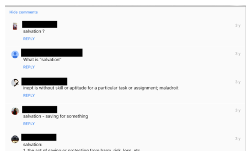
Fig. 2. Participants' interaction on Google+ (CO)

Classroom observation (CO) is used to triangulate the data for this section. Figure 2 shows a print screen from the participant interaction during Google+ classroom activities. Participants made full use of the Internet to look for meanings and definition of terms when asked by the teacher. The other participants benefitted from this activity by asking questions and providing their own version of the answer. It was observed that the roles of the teacher are as a facilitator - initiate, probe and also guide the participants to find the suitable answers. Based on the observation notes made by the researcher, this section of the interaction indicates that participants provide the meaning of new words they discovered with the help of Google search. Instead of the teacher providing the meaning and translation, participants helped each other in understanding of terms. The evidence indicates that the participants are independent students.