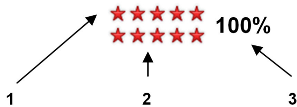
Figure 6. HEODAR representation