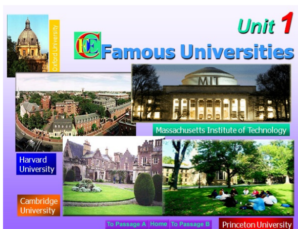
Fig. 1. Introduction to world famous universities

Design: In spite of their popularity in university, most of the existing MBTEL platforms are simply a group of slides or webpages on the contents of textbooks. The teaching effect is undoubtedly poor [10]. This calls for a systematic, scientific method to analyze, organize and coordinate the various elements of the teaching system, before integrating them into an optimal teaching plan. Below are two multimedia-based teaching cases designed by the authors.