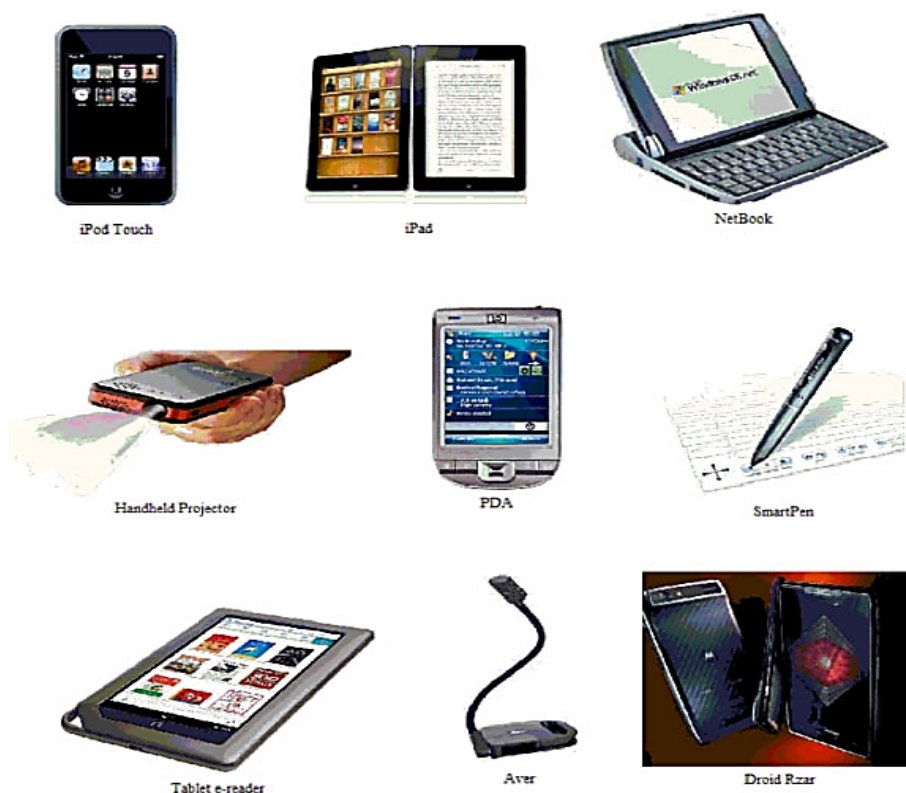
Fig. 1. Various Types of Mobile Devices [4]

handhelds are small, mobile devices that are considered “on-the-go” computers. A third classifying definition asserts that mobile phones, smartphones, tablet computers, eBook readers, personal digital assistants (PDAs), and other similar devices can all be categorized as mobile devices [24]. An instrumental definition states that mobile learning is the intersection between mobile computing (the application of small, portable and wireless computing and communication devices) and e-learning (learning facilitated and supported through the use of information and communications technology [25]. Thus, mobile-assisted language learning (MALL) is defined as learning occurring with the help of mobile devices [26; 27; 28]. Finally, [29] defines mobile-learning as “learning across multiple contexts, through social and content interactions, using personal electronic devices” (p.4). Some of the introduced devices are shown in Figure 1.