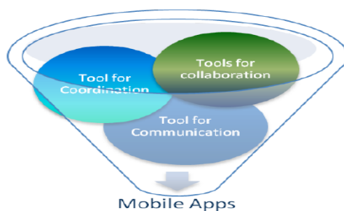
Fig. 2. Tools for Handhelds [10]

Based on [42; 43; 44; 11; 45] and [46], apps come in one of three main categories—native apps; having operating systems, web/cloud apps; cloud/web-based, or hybrid; combining both previous characteristics. Prior to discussing various types of applications available for EL teachers to use in language classrooms, specific requirements should be set first. [47] asserts on two main requisites for adopting new technology within formal educational systems. These requirements are that educationalists should first validate the pedagogical effective role of technology and view it as an improvement. Second, they have to check both the availability and accessibility of modern technology to all the involved in the teaching/learning process.