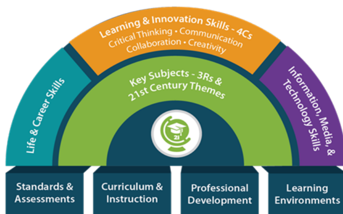
Fig. 4. Framework for 21st Century Learning [52]

In addition, mobile learning technologies well foster and aid 21st century language skills as stated by Partnership for 21st century learning [52] in Figure 4.