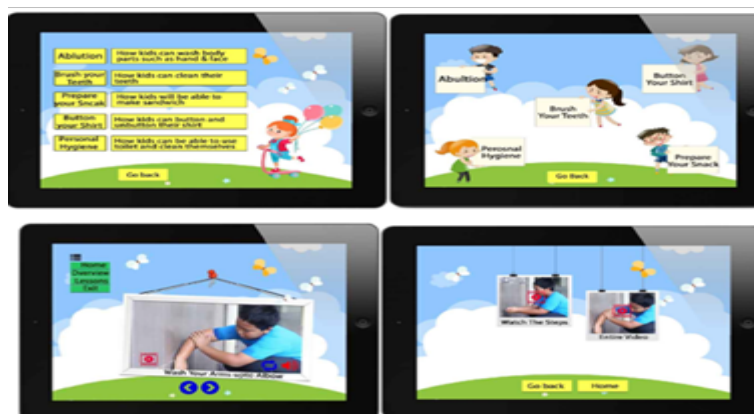
Fig. 2. Autism aid application