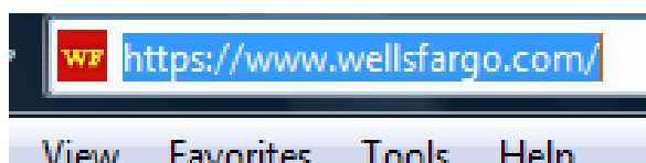
Figure 3. A URL address of a certified website.