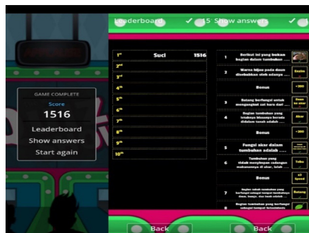
Fig. 3. Achievement page view

After the student has completed all the questions in the quiz, the Score obtained by the student will be displayed. There are also three options in the display, including Leaderboard, Show Answer, and Start Again. In the Leaderboard, the score ranking of all students who have answered the quiz will be displayed. Show Answer will display the questions and answers that students have chosen previously, and for Start Again is to start playing the game show quiz again. Figure 3 displays the achievements page in this game.