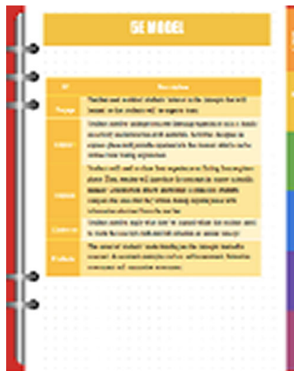
Fig. 3. Display of introduction of online module for acid and base topic based on 5E model

Application of online module for acid and base topic based on 5E model. This part consists of application of 5E model for strength of acid and base topic in online class. Table 2 shows a lesson plan of online module based on 5E model for strength of acid and base topic. The activities of learning are according to five phases of 5E model.