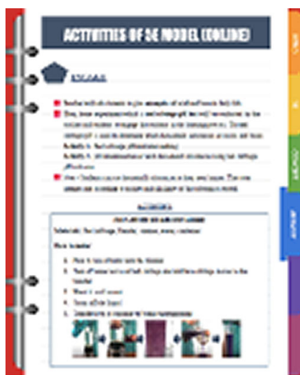
Fig. 4. Display of activities in online module for acid and base topic based on 5E model in Engage phase

Figure 4 and Figure 5 shows the display of activities in online module for acid and base topic based on 5E model in Engage phase and Explore phase respectively.