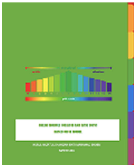
Fig. 2. Display of module cover of online module for acid and base topic based on 5E model

Figure 2 and Figure 3 shows the display of module cover and introduction of online module for acid and base topic based on 5E model respectively.