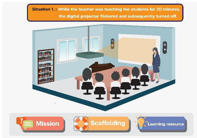
Fig. 4. Picture depicting the mission menu scene with a sample of a problem situation