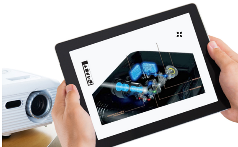
Fig. 2. A preview of examining the objects that determine the marker position reveals a 3D image

According to Table 2, the study found that the problem-based mobile AR application is effective in enhancing creative problem-solving skills, with an efficiency value of 70.00/73.00. In the small group tryout stage, the efficiency score was 71.66/75.00, and in the field tryout stage, it was 75.48/75.16. The efficiency values of E1 and E2 meet the set threshold of 75/75, which can be used in organizing instruction. The developed mobile AR application contains the following components: 1) A marker, which is used to locate an object's position, can be viewed through physical objects such as computers and audio-visual equipment and can display the position on a paper-based knowledge sheet. 2) Mission menu for problem situations 3) Scaffolding menu 4) Learning resources menu, as previewed in Figures 2–4.