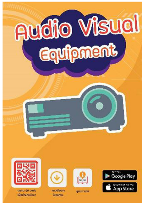
Fig. 3. Preview of a knowledge sheet where students can scan images or QR codes to log into the menu