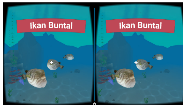
Fig. 6. Main Play Interface

The Implementation of Main Play Interface. Main Play interface is a Virtual Reality interface when we select the Start VR button and choose the types of fish, freshwater and saltwater fish. On the Main Play interface, the users will be invited to explore deep into the water to recognize various types of fish. Then, when the users point at the certain fish object, the name of the fish will be displayed. Users can see the detail information from the designated fish by pressing A button or clicking on the fish object. Afterward, they will be diverted to the Description interface. The implementation of the Main Play interface can be seen in figure 6.