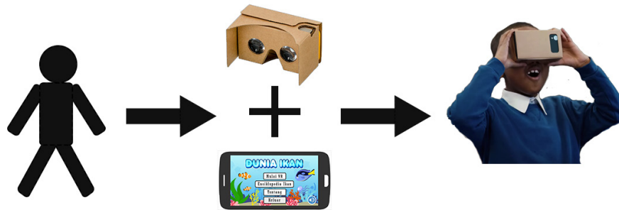
Fig. 2. The illustration of the Virtual Reality usage 1.

This application was developed by using GoogleVR SDK framework, Unity 3D, Blender for modeling and C Sharp programming language.