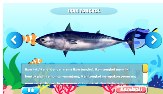
Fig. 5. Fish Encyclopedia Interface 2

The Implementation of Fish Encyclopedia Interface. The Fish Encyclopedia is the interface when we select the Fish Encyclopedia button on the main menu. On the Fish Encyclopedia interface, the users will be displayed with the fish object, including its information at the bottom of the screen as well as the narration for the fish type. Then, the users can continue seeing the next type or the other fish by simply pressing the blue button on the right. Meanwhile, the users can press the blue button on the left if they wish to go back and to see the previous fish. Furthermore, the users can stop or replay the narration by pressing the play button at the bottom of the screen. To return to the main menu, the users can press the red back button. The Implementation of Fish Encyclopedia Interface can be seen in figure 5.