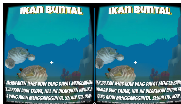
Fig. 7. The Implementation of Fish Description Interface

The Implementation of the Fish Description . Description interface is the interface in which we choose one type of fish on Main Play. On the Description interface, the users will be presented with 3D Fish objects, a brief information about the fish, as well as the narration in Virtual Reality mode. We can return to the Main Play by pressing the Back button. The implementation of fish description interface can be seen in figure 7.