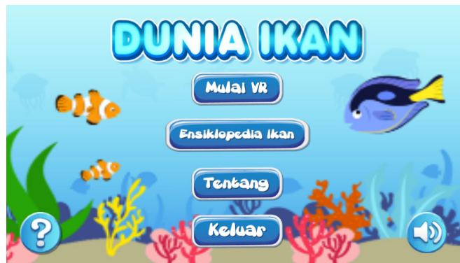
Fig. 4. The Main Menu Interface

the VR button is used to start the exploration of the seabed and the introduction of types of fish. Fish Encyclopedia button serves to display the information regarding types of fish provided in this application. About button serves to display the information related to the developer. Then, Sound button serves to display the sound settings menu so that we can set the music and narration on the application. At last, the Exit button serves to exit the application. The main menu interface can be seen in figure 4.