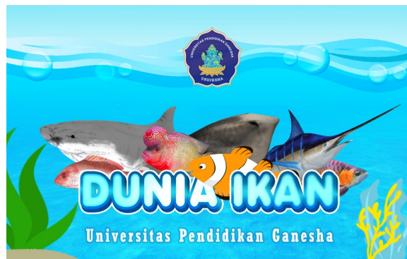
Fig. 3. Initial Interface ( Splashscreen )

The Splash Screen or the initial interface will begin to appear for a few seconds before entering the main menu. On its implementation, the Splash Screen was made on a theme of the sea, in which the application title, images of fish and Undiksha logo were displayed all together. The interface of the splash screen can be seen in figure 3.