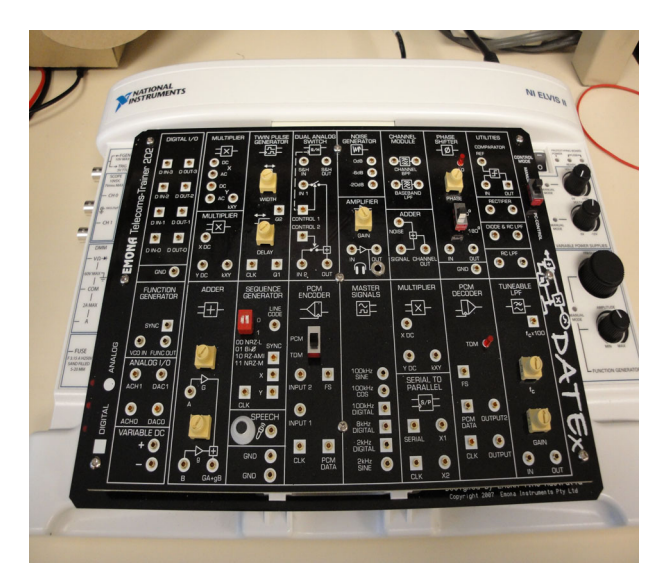
Figure 1. Emona DATEX-ELVIS II communications bundle