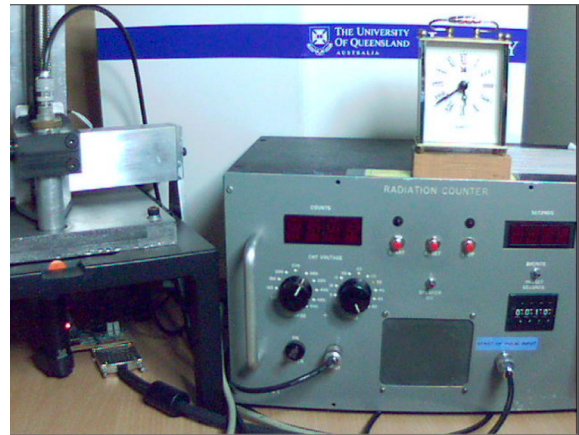
Figure 2. Live webcam view of Radioactivity iLab.

duced randomized error across all measurements to mimic sampling error seen in real data. 2 This randomized sampling error produced slightly different results for each experimental trial. All subjects were prompted to write reflective responses throughout the lab in the online lab journal that was part of the web interface, and then were asked structured interview questions upon completion of the experiment. In addition, to assess if the subject had any content or process learning gains from the lab experience, we administered identical tests before they conducted the online lab and immediately after completion of the lab.