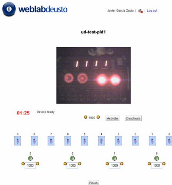
Figure 4. WebLab-DEUSTO-PLD interface

autonomous and significant learning, and to support students.