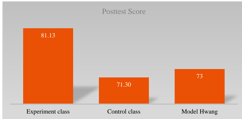
Fig. 3. Posttest Experiment Class, Control Class and Model Class (Wang & Hwang, 2017)