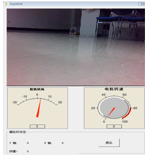
Figure 3. Interface of the control software

To avoid misuse, the manipulator should be informed of their key operations timely. The joystick status bar can display operation status on the interface.