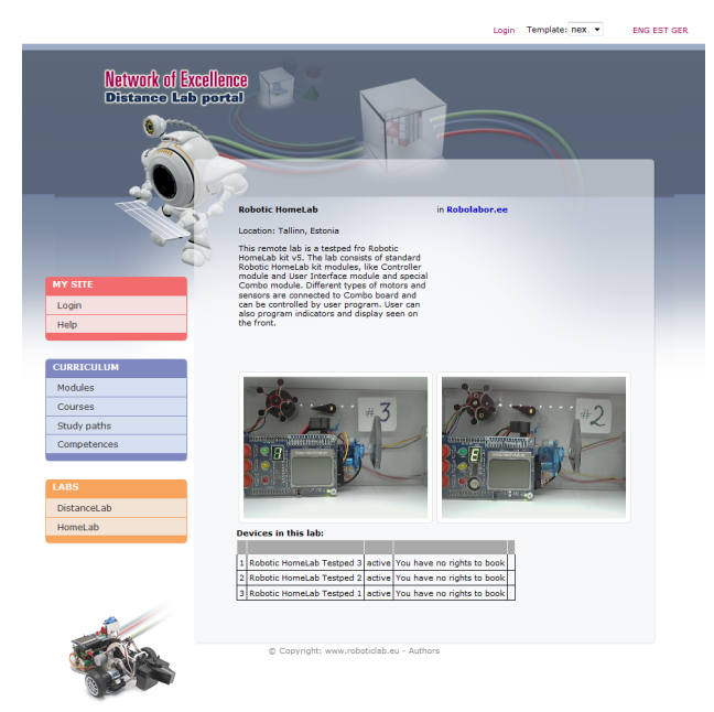
Figure 5. Lab overview in DistanceLab portal

The Fig. 6. shows the programming interface of one particular lab. In this case a C-language programming interface is implemented for controlling the Robotic HomeLab kit test bench remote lab.