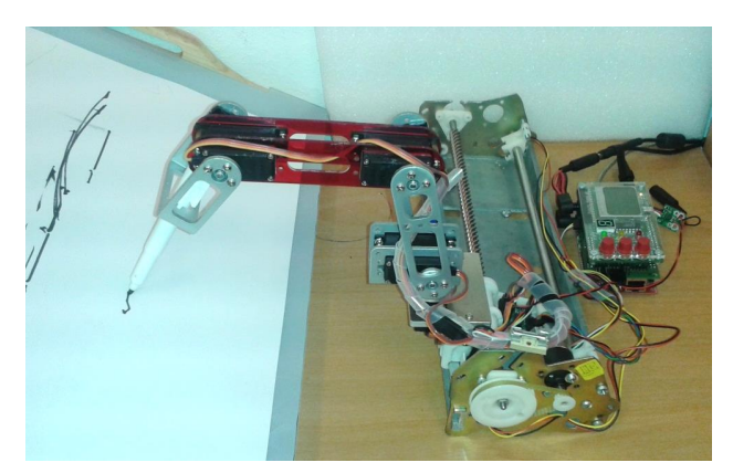
Figure 3. Robotic HomeLab kit test bench in Robolabor

tion feature. An intelligent house creates a secure, economic, comfortable and healthy living environment and has the functionalities of remote monitoring and control. According to the intelligent house concept, maximum comfort should be created for the inhabitants of the house while economizing on resources. A similar concept can be applied to growing plants in a greenhouse, where the smart house concept is transformed into the smart greenhouse concept that aims to optimize growth conditions for plants and automate the growing process. There are a lot of work and activities around a greenhouse, but some of these activities are routine and relatively easy to automate. As day and night temperatures vary considerably in our climate, the greenhouse has to close hatches in the evening and reopen them in the morning, so that the plants would not be too cold in the night and not harmed by the sun in daytime. Without automation, the gardener depends on the greenhouse. Besides air temperature, air and soil moisture also have to be kept under control in the greenhouse. Stormy winds are not uncommon; these can harm the plants or the greenhouse construction. In the case of a storm, all hatches need to be closed. The following recommended activities can be listed for a greenhouse and need to be solved in a systematic manner: