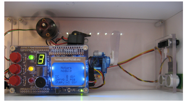
Figure 1. Robotic HomeLab kit test bench in Robolabor

The aim of a smart house concept is to concentrate all of the functions controlled by the house into one system, offering increased comfortability, security and reduced energy consumption that are achieved via intelligent control algorithms. What makes the house intelligent is the joint impact of these functions and an autonomous regula-