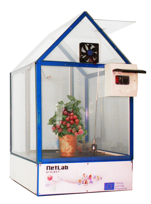
Figure 4. Smart Greenhouse remote lab hardware

The remote lab developed for controlling the intelligent greenhouse is established in Võru. The concept behind the educational smart greenhouse is that agriculture and mechatronic students can work together as an interdisciplinary team. Student teams have to develop the growing conditions for tomato and develop the algorithm for reading sensors and controlling actuators. Educational remote greenhouses are developed and included in the DistanceLab portal so that team members from different