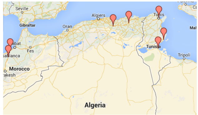
Figure 1. Test beds

The participants of the evaluation will be students and teachers of Universities from Maghreb countries that are participating in the project (i.e. Morocco, Tunisia and Algeria). The main test bed universities are the following (Figure 1):