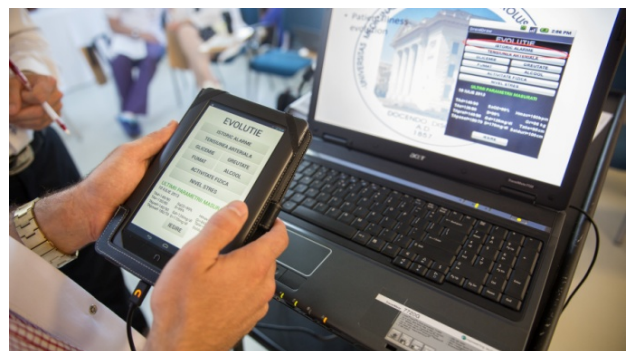
Figure 2. The Central Server