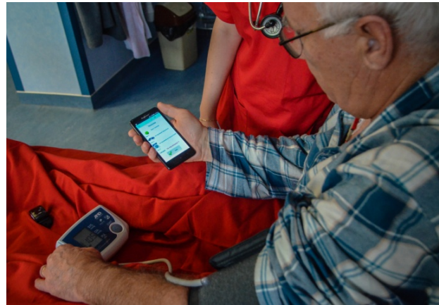
Figure 3. Patient using CardioStar application

This evaluation was done using a personalized MAST (Model for Assessment of Telemedical Solution) e-Health impact evaluation questionnaire that was completed after six months of evaluation of our telemedical solution.