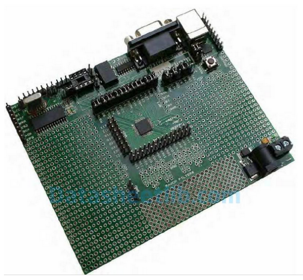
Figure 2. The FPAA development kit.