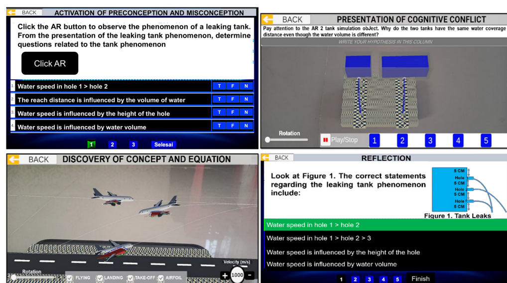
Fig. 2. AR with CCBL stages

The AR product was designed by incorporating every element of the cognitive conflict model stages. Four main menus represent a stage of the cognitive conflict model, guiding users through the learning process. Each menu provides easy access to information on every page of the CCBL model stages. The characteristics of the AR product aligned with the CCBL model stages are presented in Figure 2.