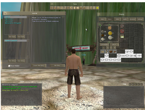
Figure 4. Working on assignment

The chat system contains several channels dealing with: people close by, people in the same area, all people, a help channel, and an off topic channel for all communication not directly linked to the environment and learning. The chat window is seen in the screenshots as the window on lower right part of the screen in figure 1 and 2. Trading is an option for players to buy and sell different items. It must be noted that most items are allowed to be bought and sold, this is a limitation we have set and the reason for this restrictive practice is that it is the possession of these items that is used to track the progress of the students through the environment. All basic components that is bought by the students from the in game shops are freely tradable and a group of students can cooperate on the purchases and thereby progress quicker than non cooperating students.