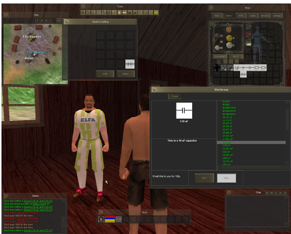
Figure 3. In the shop

The game also contains a system for communicating with other players. It is the author hope that with enough students plying the game at the same time this will be the primary source of help. To facilitate the use of in game communication, there are two main ways for students to interact with other students in the environment, these are the standard facilities used in all MMORPG type environments, chat and trading.