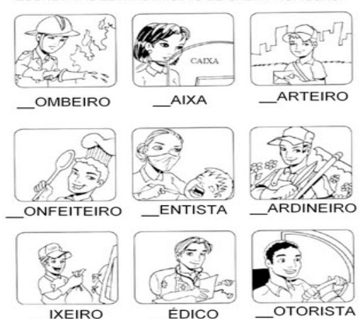
Figure 1. Activity teaching Portuguese

ESCREVA AS LETRAS INICIAIS DE CADA PROFISSÃO: