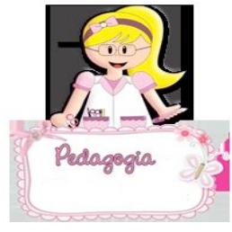
Figure 3. Representative picture of the theme educator profession