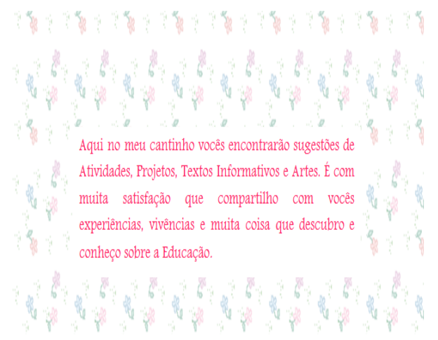
Figure 4. Print screen of Teresa's weblog